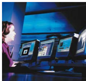
Independent or simultaneous switching of KVM and peripherals

The MultiVideo DVI can be connected to an additional unit and synchronized to switch video from multiple computers. When a switching command is sent to the master unit, it sends the same switching command to the secondary unit. Both units are switched to the same CPU port and video is displayed on all of the connected monitors.